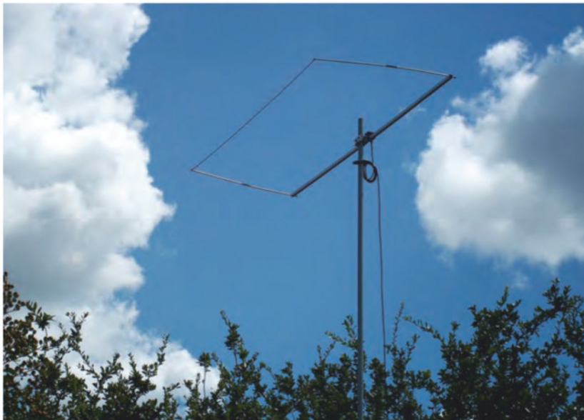
Photo B. Six-meter Stressed Moxon from Par Electronics. Compact at 84 x 31 inches and lightweight.

triple hop, which can take your signal across the country or (depending on your location) across an ocean.