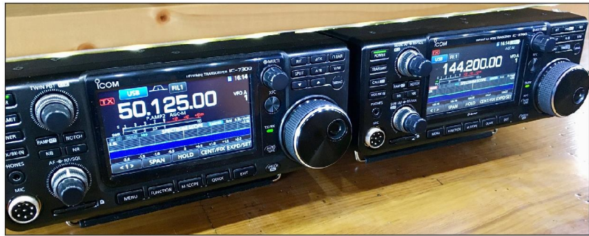
The K5ND home station. This may not be an average setup, but getting started only requires having a radio available for 6 meters.

the ionosphere's F layer, which only happens on 6 meters during the high point of the sunspot cycle. On the VHF side, that includes tropospheric ducting and auroral scatter. Aurora is solar storm driven, and it helps if you're in the northern latitudes. Tropospheric ducting can happen on 6 and higher bands for modest but surprising distances. But, for me the magic is sporadic E or E — also known as E-skip.