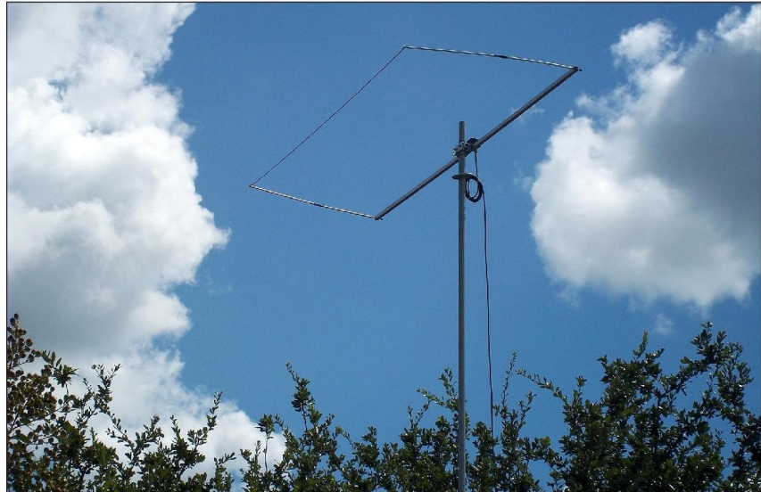
Six-meter stressed Moxon from PAR Electronics.

Six meters forms a twilight zone between HF and VHF propagation modes. On the HF side that includes F 2 propagation, signals bouncing off